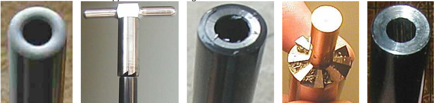
Left to Right - factory barrel, ready to start, after a few turns, remove shavings, ready to finish

Oil is applied to cutter and muzzle before any cutting is performed. It is also wise to apply oil to pilot to reduce possible friction to rifling lands. Periodically stop cutting to clean metal shavings from muzzle, bore and tool. Oil should be re-applied before cutting continues.